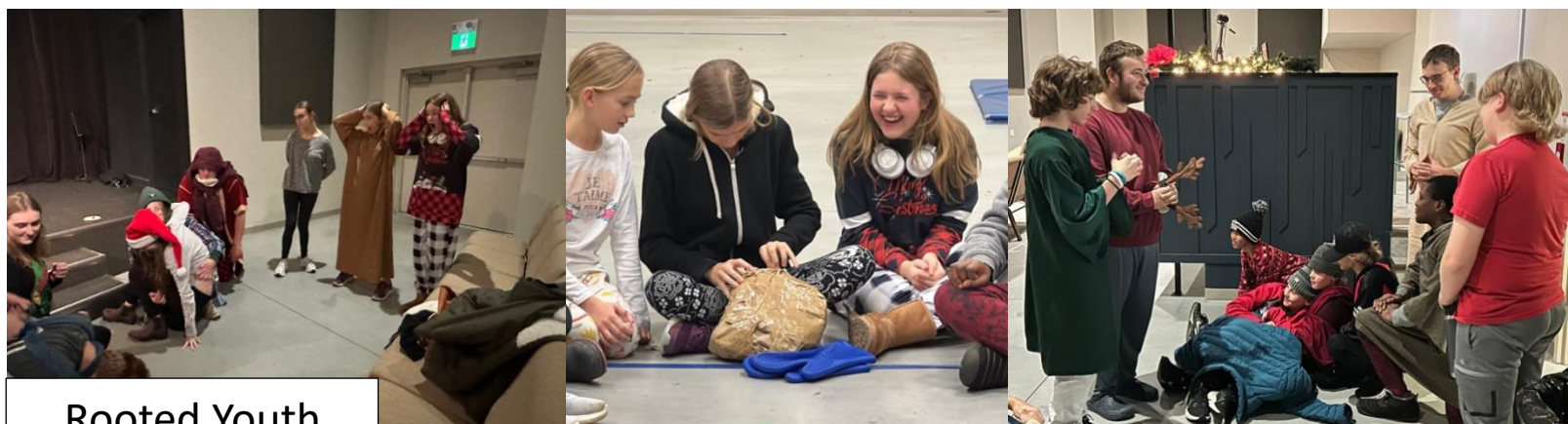
Rooted Youth Christmas Night